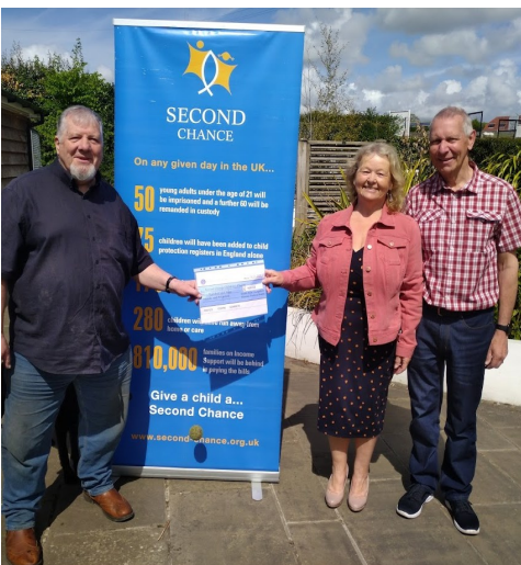
Cheque Presentation for £509 from South East Hampshire Masons Festive Board.

The problem with this year is that dividends and investments have not done as well as they might in normal times and the trust funds and companies that relied on the performance of these to donate to us have had diminished returns and therefore they have been unable to pass as much or anything on to our work this year. It looks like we might be as much as £150,000 down on our expected income this year. This is not disastrous because as you will see elsewhere in this news letter we have not spent as much because of the