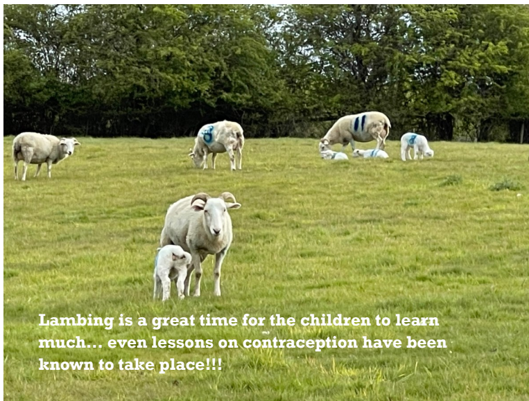
Lambing is a great time for the children to learn much... even lessons on contraception have been known to take place!!!

The sheep give biological and life lessons, the chickens, cows and other animals all contribute to a valuable life experience for the young people and allow us to work on their social skills too.