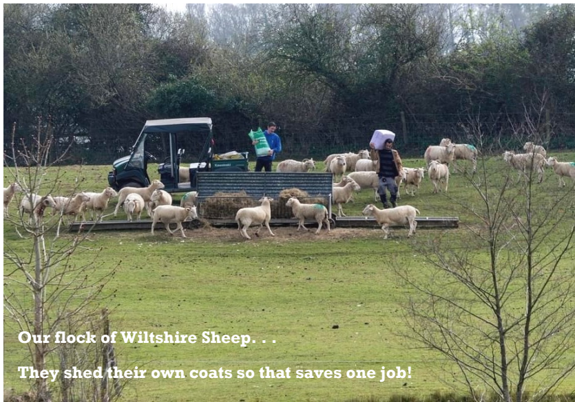
Our flock of Wiltshire Sheep . . . They shed their own coats so that saves one job!