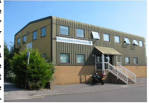
Second Chance House in Portsmouth. Portsmouth City Council have decided to charge us for not charging them!

We have had to borrow money from the building fund in order to avoid a court order. We don't think that's exactly friendly for an authority that we have saved millions of pounds for over the years. It's especially unfair in that although they say they cannot afford to be discretionary we know of dozens of other charitable organisations in the city that don't get charged. Although the City Council tell us they are charging other charities we don't actually know anyone who is being charged! We house, free of charge, another charity in the city and would not dream of charging them or passing a charge on.. Do unto others and all that! Hence the headline about biting the hand that feeds it. We wonder if it would be better to pull out of Portsmouth and just transport the children we are working with to our Rural Centre where Winchester City Council honour and help us.