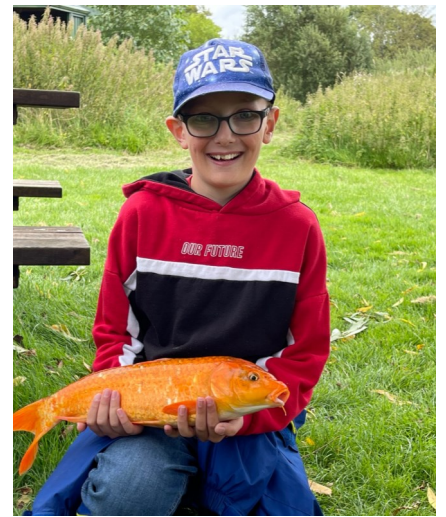
Some random pictures of children catching fish from our lakes—life changing for many of them.