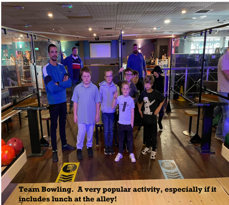
Team Bowling. A very popular activity, especially if it includes lunch at the alley!

Many of our children will leave school without any meaningful qualification (indeed that is if they went to school at all). This is not to say that most of them lack any intelligence, far from it. So we aim to teach them or help them discover qualities that will make them highly employable. Social skills are top of the list, work ethic is high too and generally a realisation that being a nice person can have its rewards and get you noticed. This is not easy and we have to get inside their heads and win their confidence to do this. A lot of this can be done in social and leisure activities. Don't confuse this with the old chestnut of rewarding bad behaviour... our youngsters really earn anything we give them. Here are a few activities we have repeated throughout the year.