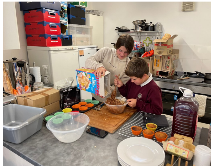
Cooking In Our Kitchen! Independent Living Skills are an important and forgotten art it seems!