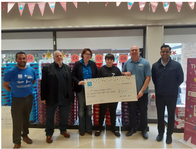
Our Local Co-Op Stores Raised £5,415. Here is the presentation in The Highland Road store in November.

Thanks to Wave 105 , the local radio stations Christmas Appeal, we had bundles of presents for our underprivileged children at Christmas.