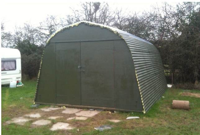
We built a new building 'The Canteen' on the edge of our utility area to help with accommodation when groups camp or spend time in cold weather there. The log burner should prove interesting as the cold weather arrives!

the classroom as a reward for good work to a whole week spent under canvas at the side of the lakes. The summer started early and was very warm and dry until August, when things got a little wetter. We have plans for improving our facilities so that more children can spend more time at the Centre regardless of weather and time of year. We have a small farm on one side of The River Meon where the young people learn that cows don't lay cartons, chickens don't have cellophane coverings but lay eggs and that sheep give birth in a most biological manner! Across the river our Nature Reserve ticks all the boxes for conservation and environmental improvement and contains the lakes and carrier stream that the young people fish and spend hours enjoying the countryside. Lastly across the carrier stream we have the old Garden Centre and Nursery where we are trying really hard to restore the nursery to a fully functioning one where young people will learn much about horticulture, work experience and mini enterprise—but more of this later in our report.