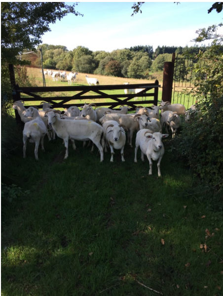
The flock of Wiltshire sheep continues to grow and teach the youngsters much