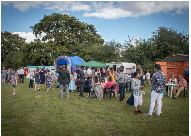
A big event on our amenity area

We live in exciting times and the journey is speeding along. To recap: first you will remember we gave £100,000 to the owners of the old garden centre in order to avoid them having to go to auction with the property. In return they gave us 2 years to raise the balance of £700,000. Some time after that and having worked hard at raising the money we went back to the family with another offer late last year. We offered them a further £350,000 with