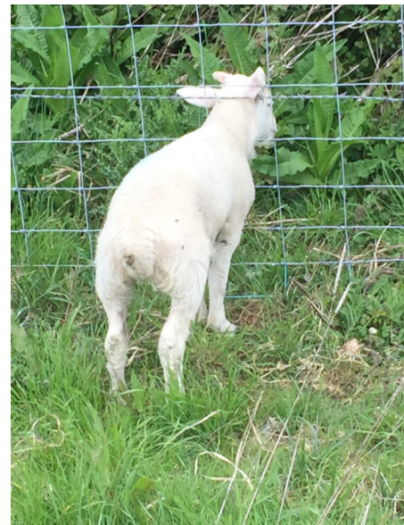
It's quite an experience for an inner city youngster to have to release a lamb when it got its head stuck in the fencing wire!!

The Farm has continued to tick along, the interesting addition is the newly planted fruit orchard occupying about 2 acres of one field. It is populated by old fashioned traditional English varieties, grown on vigorous root stock, which will produce trees big enough for the children to climb when picking the apples! It also helps support an ecology that is struggling as supermarkets and fashion have resulted in most of these varieties being ripped out - leaving a gap in the habitat for wildlife that had adapted to the old style of orchards for centuries.