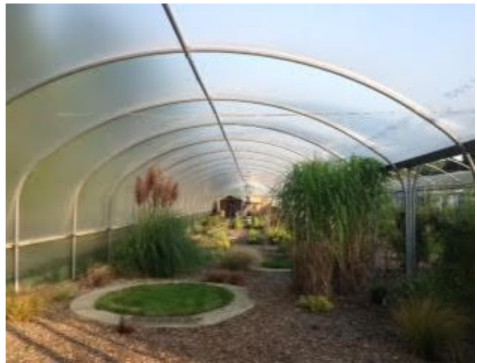
The Seedlings in early 2014. We cleared several tons of rubbish and probably 20 tons of concrete to reach this stage