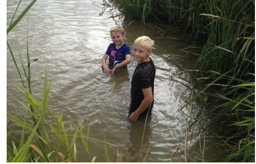
Swimming in our mill pool in August of this year... The experience of the countryside for our inner city youngsters can be a life changer

the classroom as a reward for good work to a whole week spent under canvas at the side of the lakes. The summer started early and was very warm and dry until August, when things got a little wetter. We have plans for improving our facilities so that more children can spend more time at the Centre regardless of weather and time of year. We have a small farm on one side of The River Meon where the young people learn that cows don't lay cartons, chickens don't have cellophane coverings but lay eggs and that sheep give birth in a most biological manner! Across the river our Nature Reserve ticks all the boxes for conservation and environmental improvement and contains the lakes and carrier stream that the young people fish and spend hours enjoying the countryside. Lastly across the carrier stream we have the old Garden Centre and Nursery where we are trying really hard to restore the nursery to a fully functioning one where young people will learn much about horticulture, work experience and mini enterprise—but more of this later in our report.