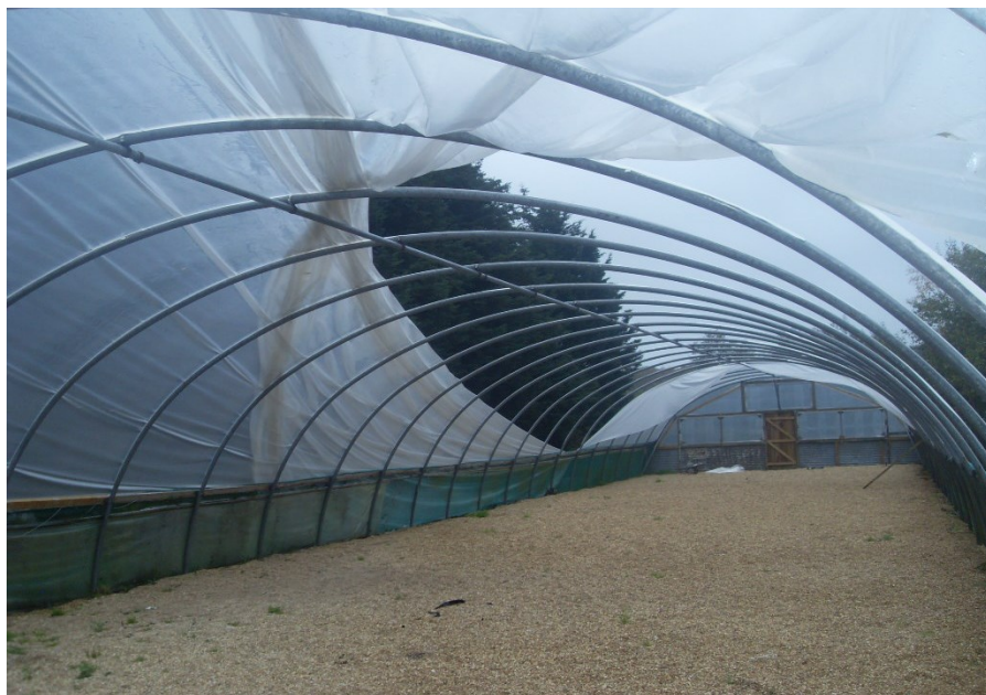
The 'Great Hall' today!

There are times you feel you can't win. A "one step forward two backwards" situation. Since writing the beginning of this report and just before printing Hurricane 'Abigail' (why have they started giving names to weather systems?) struck with all its force on Saturday 14th November late evening. I am afraid to report (after all the hard work and fundraising and generous support) the wind shredded the "Great Hall"... we were gutted, what a disappointment not just to us but the guys from the Navy who put it up and all the other supporters. What a discouragement.