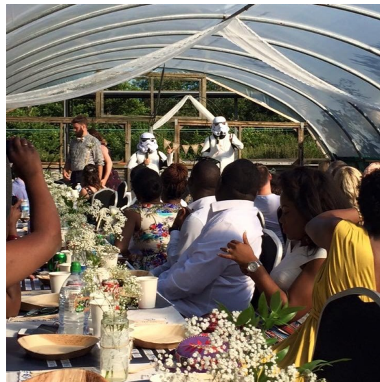
The Wedding Reception—Yes, those really are storm troopers—don't ask!!