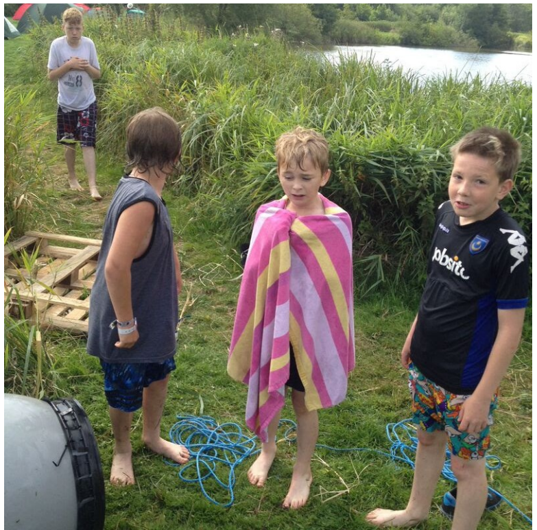
Raft building and floating are always a great hit with the youngsters. In this case, back in August, maybe floating was an exaggeration, but the swim did them good and was a lot of fun!

Our 'Back To School' scheme has continued to be a back bone of our work in the Portsmouth area. With the increased autonomy given to young people through the politically correct regimes they are growing up in, they increasingly feel empowered to disengage from the system. There is nothing worse than a child who has totally disengaged; he is uncooperative, often aggressive, very behind academically, frequently socially inept, sometimes amoral and commonly unmotivated to do anything in life. If left they will drift through life, most often on benefits, they will stray into and out of relationships and generally remain on the periphery of society. It is therefore imperative that we get to these young people and re-engage them. Getting them back into full time education is our aim and we are pretty successful in this but taking it further and teaching them new social skills and hooking them on meaningful activities in their leisure time means we most often see a huge increase in the quality of their lives... which is what it's all about... one child at a time!