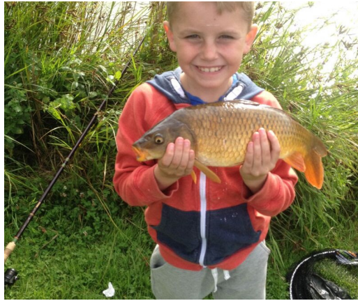
A first specimen fish—out of our lakes—what a difference success can make to a child's life.