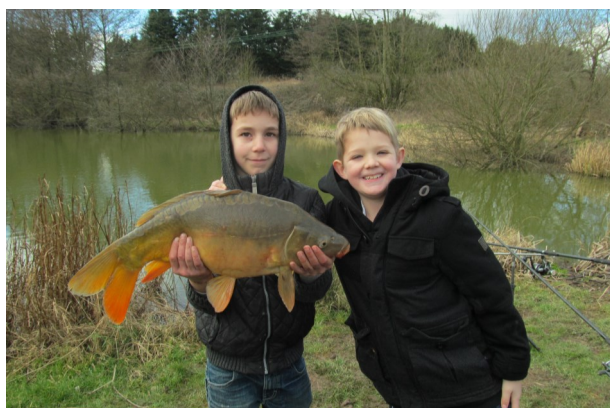
An early season first fish for a very happy punter!