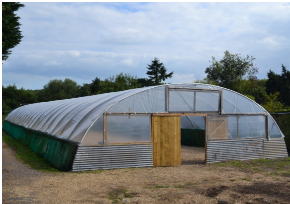
The finished polytunnel. The biggest of 20 and the third to be completed

Thus we refer to our largest polytunnel... So named because one of our volunteers had his Wedding Reception in it back in July! Courtesy of The Navy working party from HMS Nelson, BPI Visqueen (the manufacturers) and Trust Funds who supplied the other finance, we completed the re skinning of the tunnel. Ultimately we intend to grow Koi carp in there—each young person given a tank and some fish fry from which they will then learn that hard work and application will grow these fish to the point that they can put an advert on eBay and sell the fish—keeping the profit for themselves. The lessons and the skills they will learn from this mini enterprise scheme will be many fold and deep—skills they may not pick up from their educational institutes wherever they are.